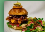
Chicken Chef's "Chef Stacker"

Get a swag bag including dessert & gift with each meal ordered!