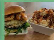
Elm Creek Café's "Surf & Turf"