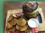
Breakaway's "Beaver Buraer"