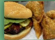
Big Willy's "Smoked Sampson"