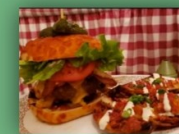
Scotswood Links' "Burgasaureous"

Carman Area Foundation celebrated its traditional gala at home this year, supporting six area restaurants in the first ever Dine-at-Home Gala. Over 400 burgers were ordered and donations received are sitting at over $66,000. Thank you to everyone that supported CAF during the event. We sincerely hope we are able to safely gather next year!